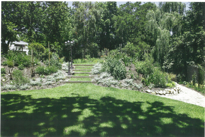
CAPE CONTOURS 021 712 1647

ABOVE: Sold! How often do we hear that a house has been sold because of the garden? When renovating or building, the importance of setting aside a budget for the landscaping of the property from conception is often overlooked. A well landscaped and maintained garden adds phenomenal value to any property. The spectacular garden featured here benefited from a landscaping budget set aside from the start of the project. The landscape and architecture fit like a hand in a glove.