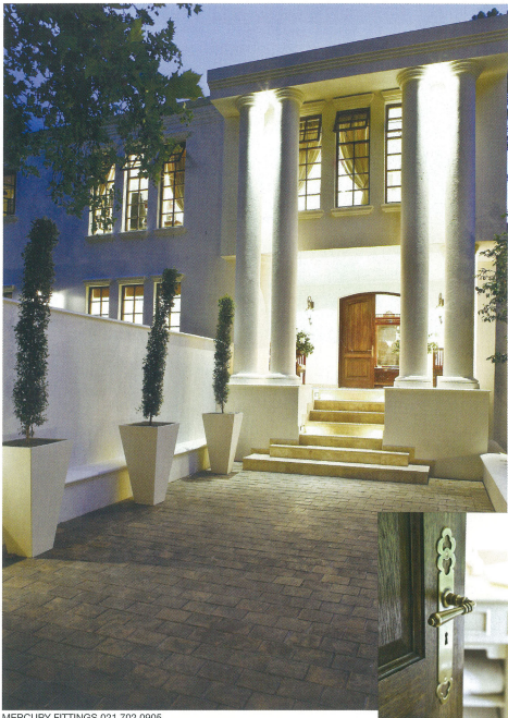
MERCURY FITTINGS Q21 702 0905

Amongst the many items on the renovation list, was the priority of creating completely separate entertainment areas, including a private bar area and several different lounges. Added to that was the need for a spacious guest suite to accommodate regular visitors in stylish privacy, the addition and extensions of several balconies and pillars, as well as the renewal of floor surfaces and bathrooms. It was the extent of the project, despite the family