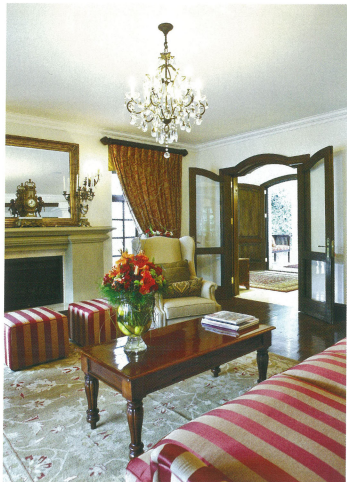
ONCE UPON A DREAM 072 456 1400

ABOVE: Once Upon A Dream created the elegant, classical ambience in this formal lounge by utilising some elements of the Georgian interior decor style, and successfully mixing it with exclusive pieces of furniture from the turn of the century. This elegant style provides the room with a warm traditional ambience.