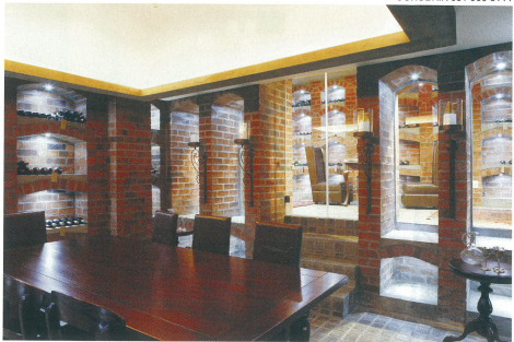
COROBRIK 031 560 3111

the dotted line, was the tall standing pine trees at the bottom end of the garden, where they keep a silent vigil over the luxurious swimming pool area. The height of the trees created a sense of grandeur, and since the completion of the renovations, these stately uprights seem to form an even greater focal point by enhancing the