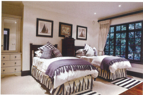
PENNY LANE INTERIORS 021 461 5454