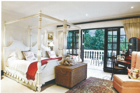
ONCE UPON A DREAM 072 456 1400

RIGHT: Once Upon A Dream created a true reflection in the girls' room of what makes a real princess. A total departure from the traditional pink, girly and frilly decor, this lovely bright and airy bedroom boasts frogs and fun, reflecting on the great outdoors and cool adventures.