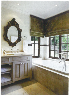
AC SCREENS &amp; SHUTTERS 021 590 5090/5

ABOVE: Penny Lane Interiors supplied furniture, window dressings and bedding for this beautiful home from its exclusive range of custom-made furniture and designer fabrics. Briefs from valued customers are executed by paying attention to the finest detail and delivering on time. View the Penny Lane Interiors product range at their Gardens Shopping Centre showroom.