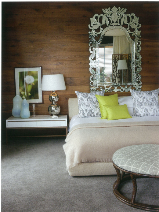
ABOVE The Venetian glass mirror and knitted bed cover are from the Cécile and Boyd's showroom, with Nexus Westminster carpeting from Belgotex. OPPOSITE The living area opens completely to the deck for easy indoor-outdoor living. Malawian water pots and delicious monster scatter cushions add to the back-to-nature feeling of the space .